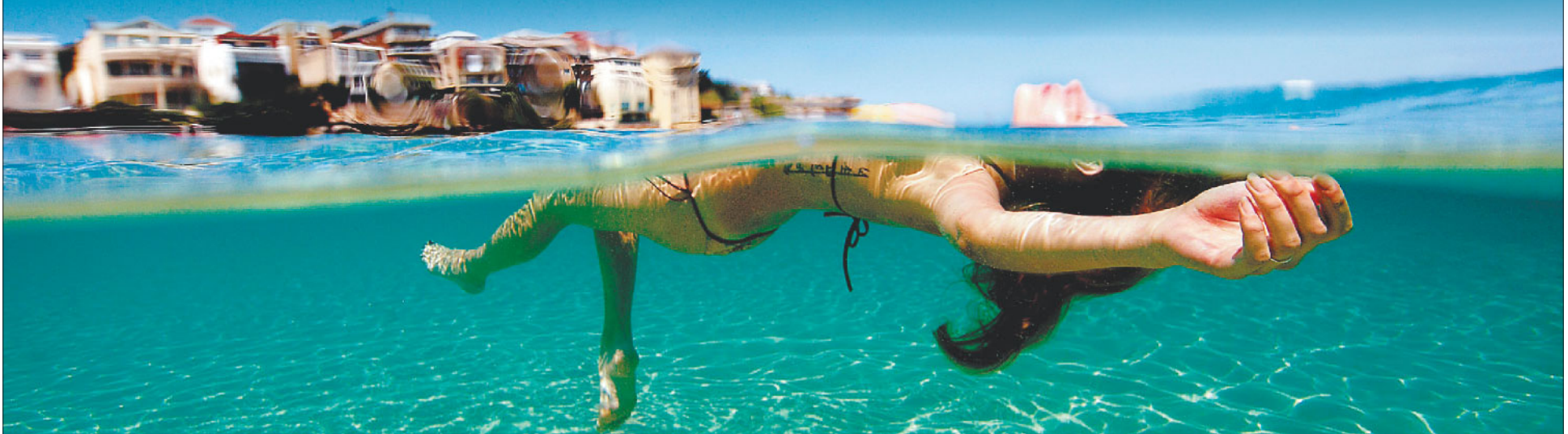
SUN SEEKERS: Images from Eugene Tan's photo book, A Day at Bondi , which focuses on life at the famous beach.